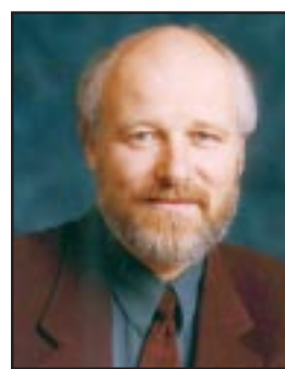
Dr. James Lunney, MP Nanaimo-Alberni, BC

On prie tous les consommateurs intéressés à empêcher nos 60,000 aliments de fonction médicinale d'être transformés en médicaments au Canada, en adhérant au groupe Amis de la Liberté. Voir en ligne, dons et adhésion au www.friendsoffreedom.org ou appeler notre numéro au 613-968-2613 aujourd'hui pour une demande d'adhésion et faire un don à La Liberté de Choix au Fonds Légal pour les Soins de Santé.