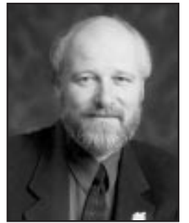
Dr. James Lunney, MP Nanaimo-Alberni, BC

Health Canada sent the police to raid the computers of a little company in Raymond, Alberta, and has obstructed delivery of the product," stated Dr. Lunney. "In